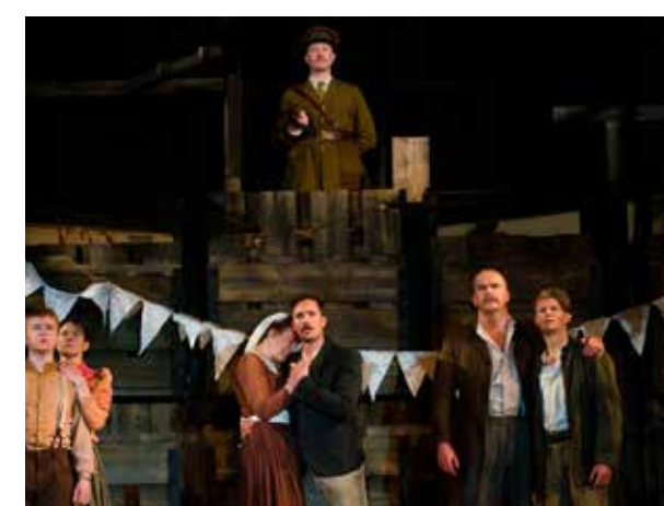
Hireth, o-region (Hall for Cornwall Associate) and Palores, St Just Miners' Chapel.

Hall for Cornwall – reopening 2021: an ambitious transformation project, opening up culture and creativity, to everyone. Including a new three-tiered auditorium bringing large-scale shows to Cornwall, programmes nurturing young people and Cornish talent, the HUSA creative and digital Business Hub, the new Hall for Cornwall will be a place with people, passion and possibility at its heart