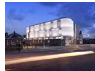
Penzance Creative Cluster: MORE THAN 1,500m 2 of studio units and tenancies for a range of creative businesses, plus space for collaboration and networking.