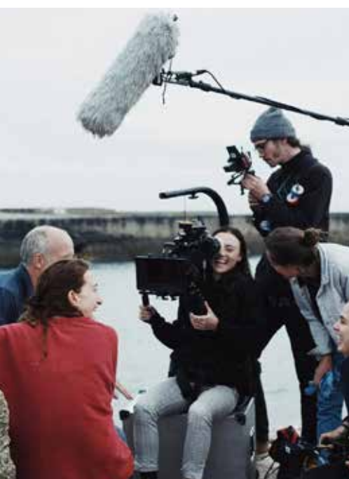
Fylm K Award, 'Yn Mor' Film project

The Creative Health and Wellbeing Partnership: enabling more creative and health projects to happen all across Cornwall