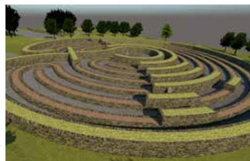
Golden Tree's Kerdroya, Bodmin Moor 2