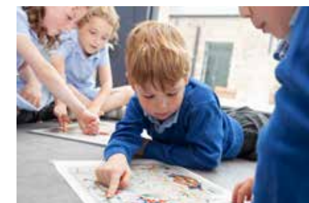
Cornish Curriculum Kresen Kernow

Cultivator: develops Cornwall and the Isles of Scilly's creative businesses through a broad programme of sector relevant business and skills support