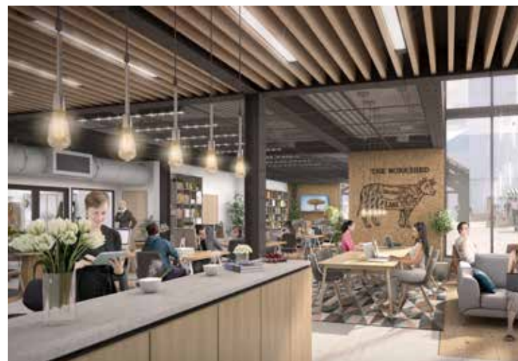
Liskeard Cattle Market, 'Workshed': 17 flexible units as well as collaborative workspace.