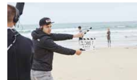
Make Up, filmed in Hayle

A Cornish Cultural Curriculum: enabling schools to deliver the National Curriculum with a Cornish perspective in collaboration with local venues and organisations