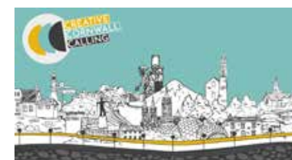
Creative Cornwall Calling Campaign

New Ways of Navigating Audio Archives Through Voice User Interfaces: Cornwall Museums Partnership once again leading an opportunity to increase use of tech in museums to enable positive social change