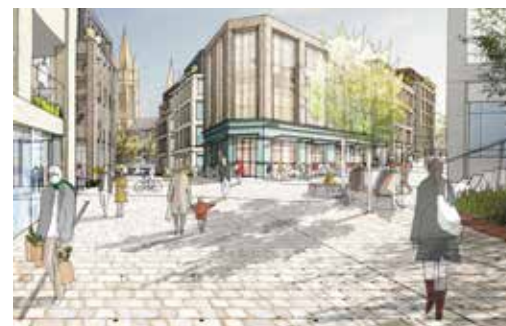
Pydar Street 'The Hive' project: creating a prosperous, inclusive and sustainable urban neighbourhood for Truro with focus on screen, digital, gaming and the creative industries.