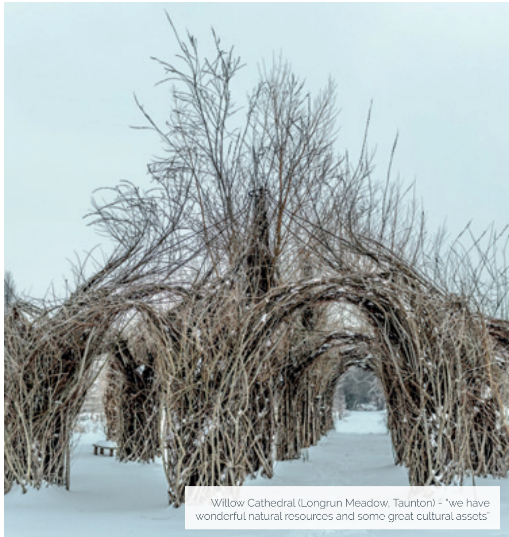
Willow Cathedral (Longrun Meadow, Taunton) - "we have wonderful natural resources and some great cultural assets"