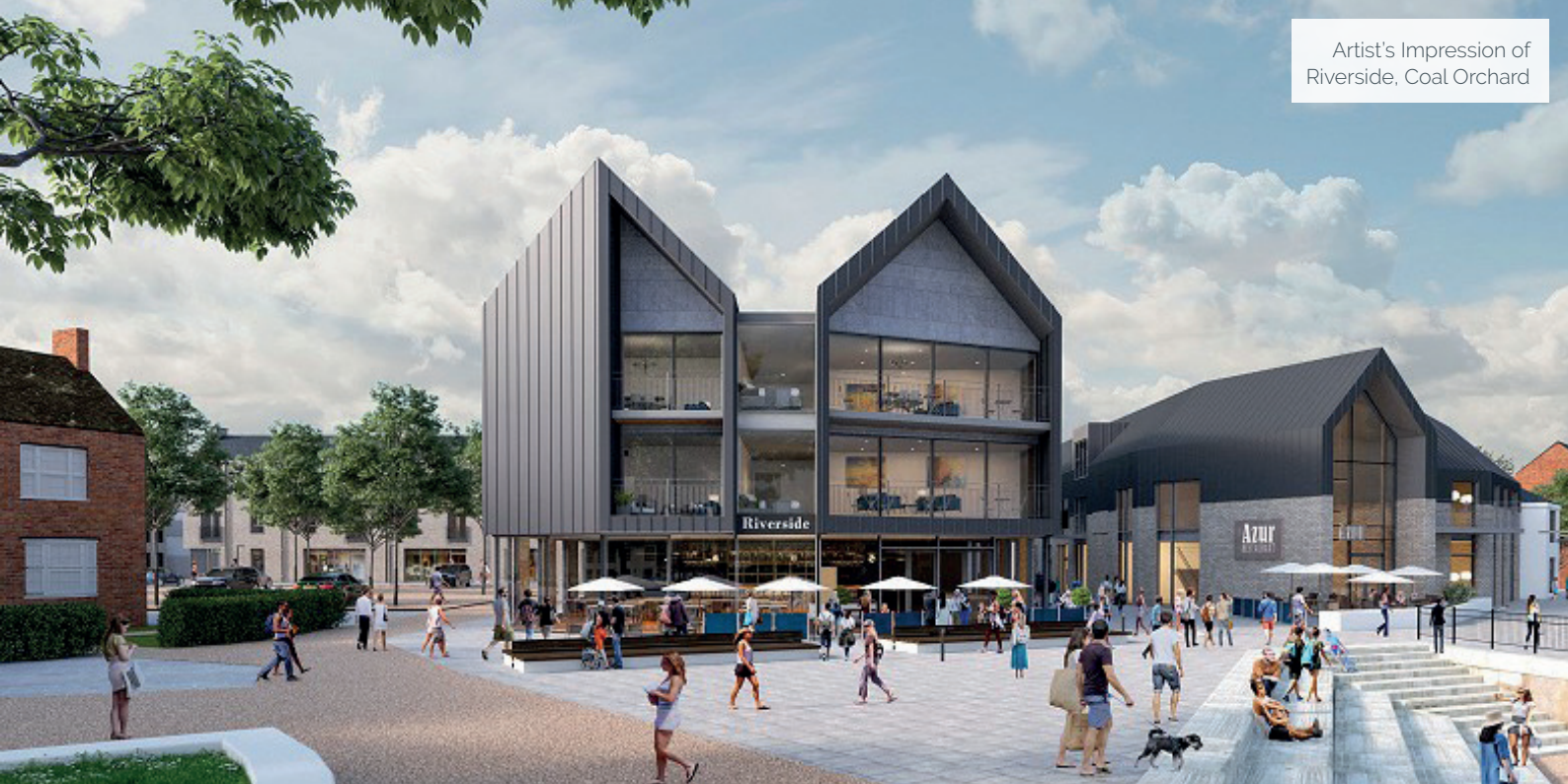
Artist's Impression of Riverside, Coal Orchard