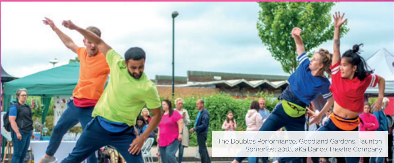
The Doubles Performance, Goodland Gardens, Taunton Somerfest 2018, aKa Dance Theatre Company