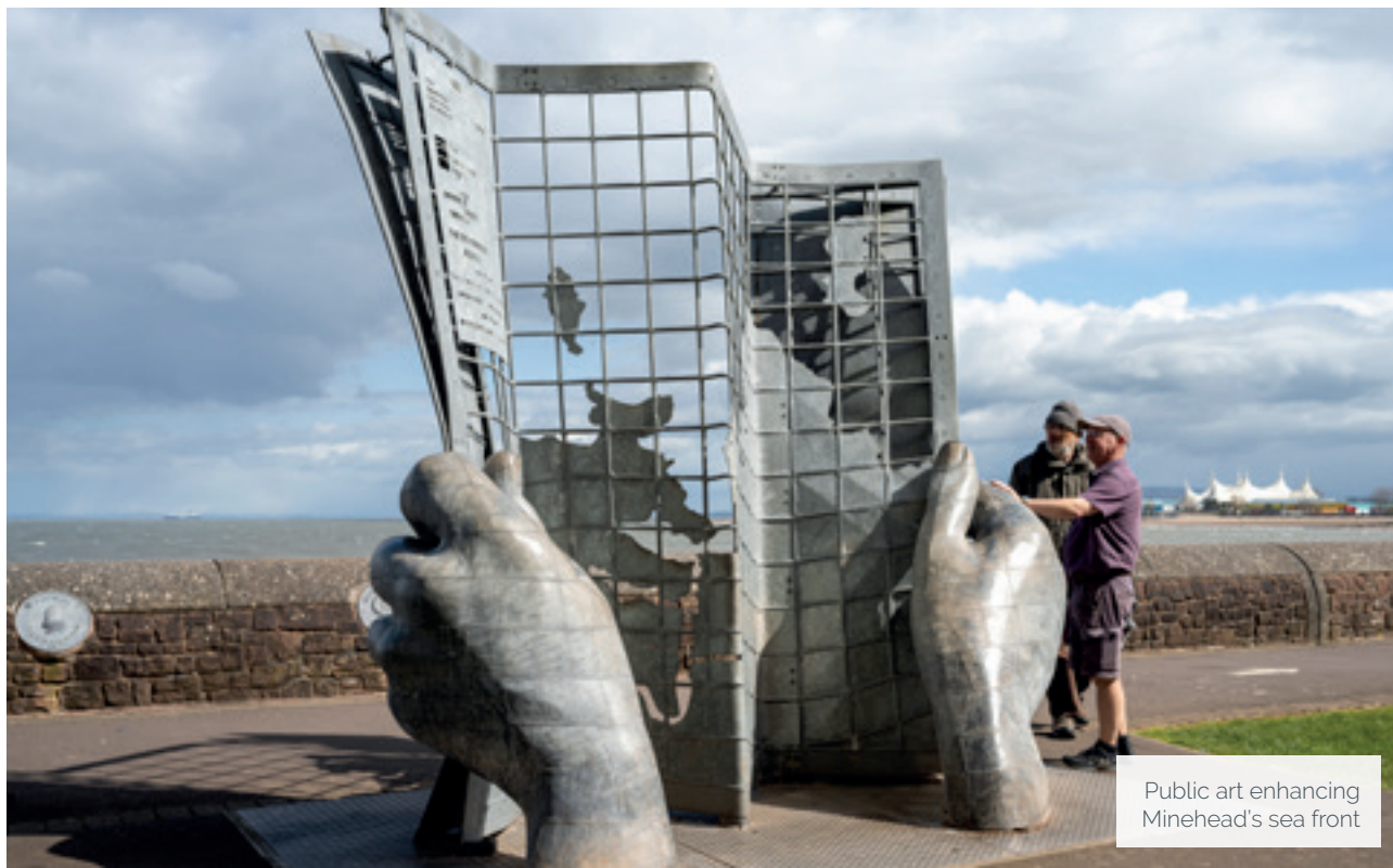
Public art enhancing Minehead's sea front

particularly vulnerable with a coastline, waterways, flood plains and agricultural industry. SWT was among the first 500 regional councils worldwide to declare a climate emergency and mitigating policies and strategies are in place to define our actions. Treating climate change as a 'cross-cutting' theme, we see that the creative industries can help convey complex messages about climate change to communities and want to foster relationships between environmental and creative partners that can result in projects that enhance our environment whilst promoting sustainability.