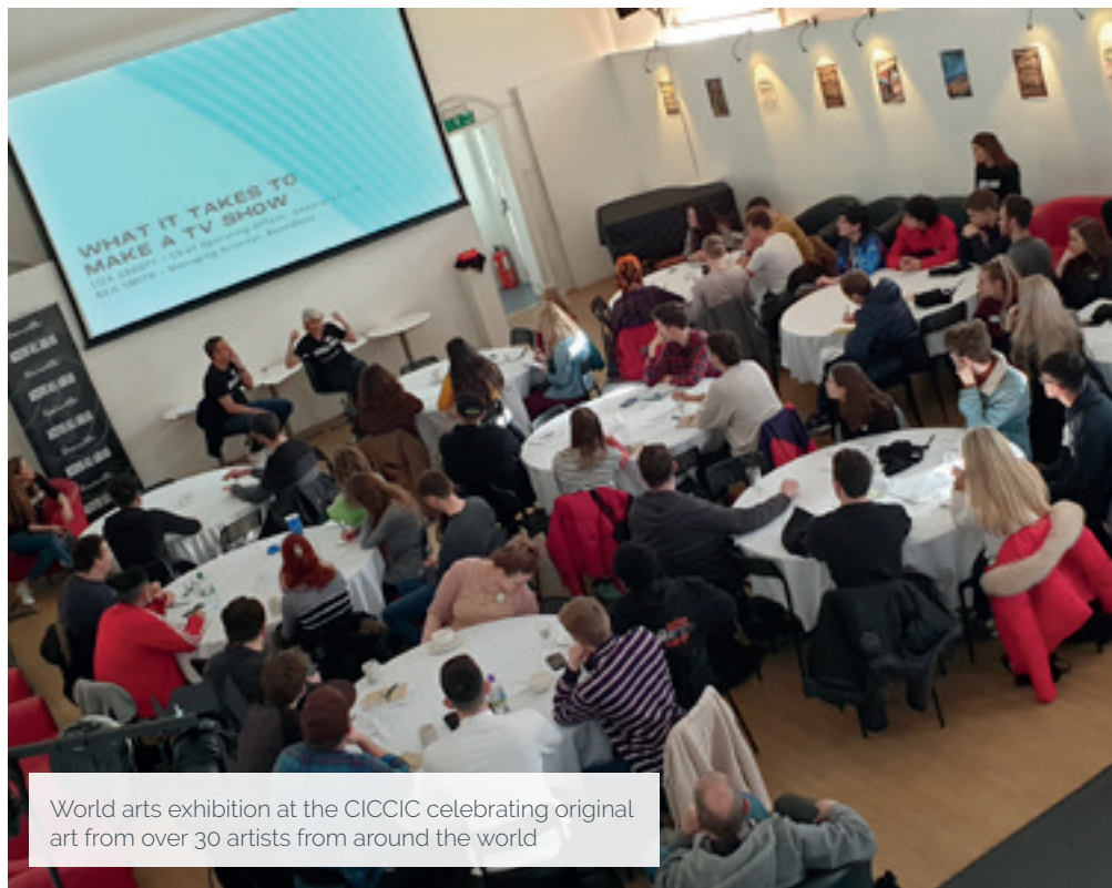
World arts exhibition at the CICCIC celebrating original art from over 30 artists from around the world