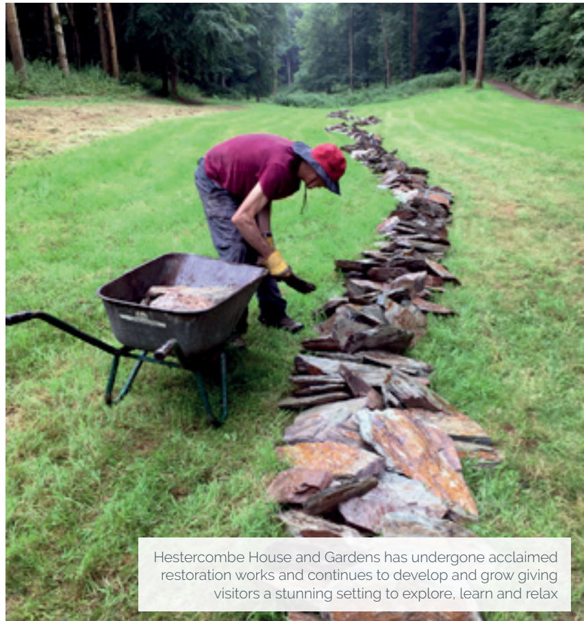
Hestercombe House and Gardens has undergone acclaimed restoration works and continues to develop and grow giving visitors a stunning setting to explore, learn and relax

and value of investment in the cultural sector, however the following are the 6 Value Domains which can be measured to gauge the value of investment and impact on the wider community: