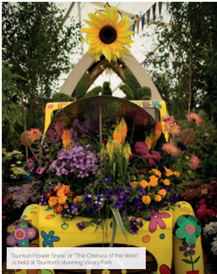
Taunton Flower Show, or "The Chelsea of the West", is held at Taunton's stunning Vivary Park