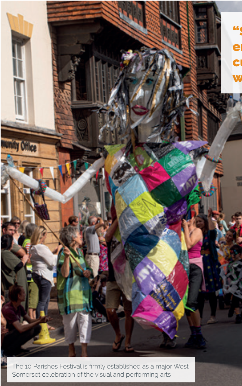
The 10 Parishes Festival is firmly established as a major West Somerset celebration of the visual and performing arts

As the UK faces the challenges of the 21st century, creativity has a role to play in shaping our response to climate change, globalisation and technological innovation – and in enabling the economy and society to ‘bounce forwards’ from the impacts of the COVID-19 pandemic. Making our place resilient and outward looking depends on creative activities of all kinds – in our professional and personal lives, in the local economy and civil society.